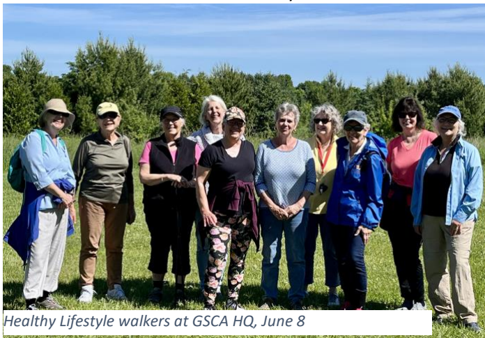
Healthy Lifestyle walkers at GSCA HQ, June 8

May turned out to be a good one for our weekly walks. They included a walk at Harrison Park, a walk at Stoney Orchard Park on the East Hill, and another around the Harbour. On June 1 st we enjoyed a nice walk on the west side rail trail and on June 8 th at the Grey Sauble Conservation Authority Headquarters on Inglis Falls Road.