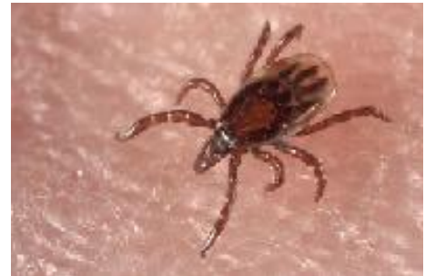
"Deer Tick ( Ixodes scapularis ) male"