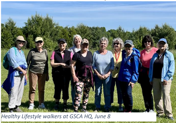
Healthy Lifestyle walkers at GSCA HQ, June 8

May turned out to be a good one for our weekly walks. They included a walk at Harrison Park, a walk at Stoney Orchard Park on the East Hill, and another around the Harbour. On June 1 st we enjoyed a nice walk on the west side rail trail and on June 8 th at the Grey Sauble Conservation Authority Headquarters on Inglis Falls Road.