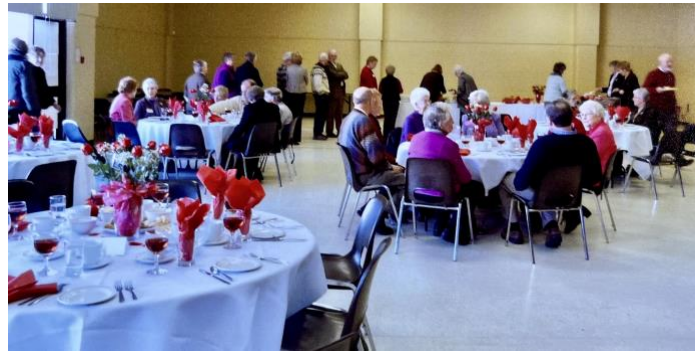
Above: Lunch & Learn at the Bayshore, Feb 2011

All in all, it was delicious and wonderful year!